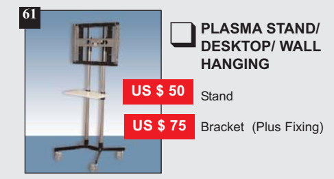
Order Form - Exhibit Rental

This form must be submitted at least 45 days prior to the event. Late orders will be subject to availability + 20% surcharge.